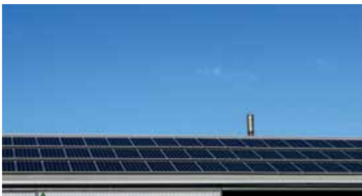
THE INSTALL: 100kW SOLAR SYSTEM INSTALLED ON SITE