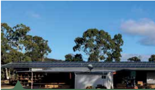
THE LOCATION: PYRENEES TIMBER, CHUTE, VIC