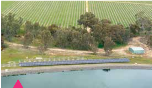
THE LOCATION: SUGARLOAF CREEK VINEYARD, GREAT WESTERN, VIC