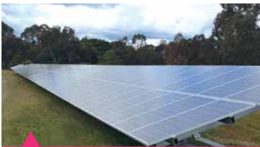
THE INSTALL: 99KW GROUND MOUNT SOLAR SYSTEM